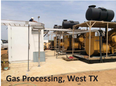
Gas Processing, West TX

Safety Management Project Delivery and Schedule Unparalleled Progress Reporting Power Experience