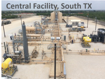
Central Facility, South TX